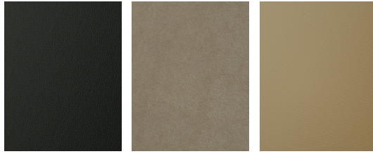
LAMILUX LAMIFOAMTEX Synthetic leather