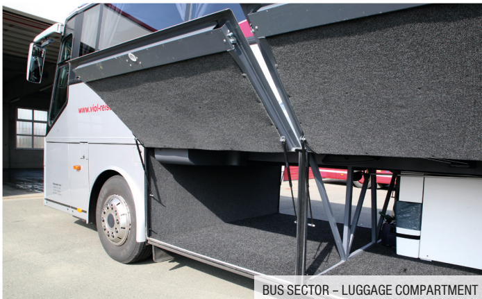
BUS SECTOR – LUGGAGE COMPARTMENT