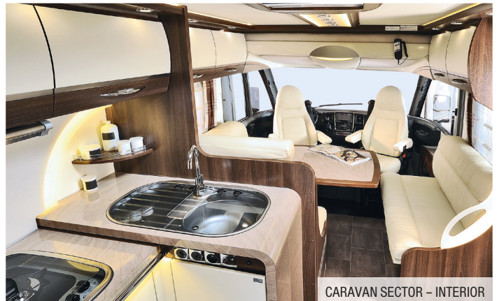
CARAVAN SECTOR – INTERIOR

The information in this brochure is based on our current knowledge and experience. It is not a guarantee of technical characteristic features in the scope of specifications. Due to the wide range of usage parameters, users themselves are responsible for testing that the product is suitable for their required use. Changes and errors excepted.